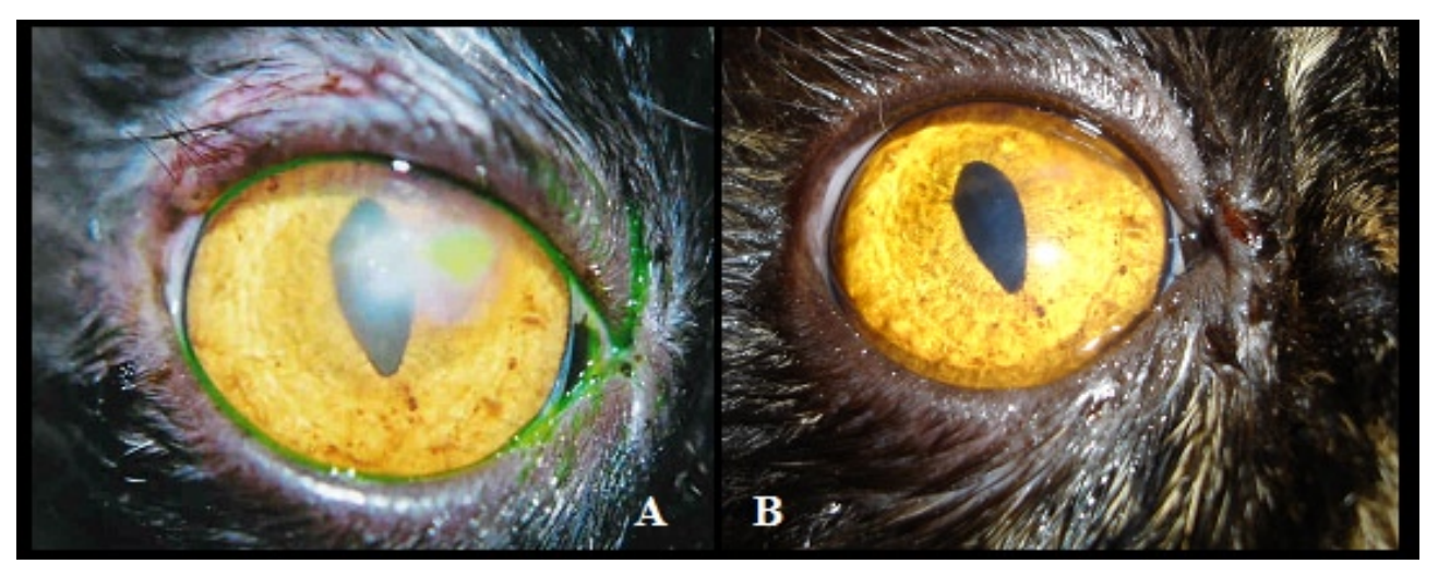
FIGURE 3. (A) Photographic image of a cat's eye submitted to superficial keratectomy superficial, at seven days post-operative. Note positive fluorescein staining and diffuse edema in the cornea. (B) At twenty days post-operative; note the reduction in edema and negative fluorescein staining