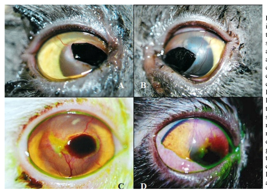
FIGURA 1. Photographic images of corneal sequestrum in a cat at initial presentation. In A and B, right and left eyes of the same animal. Note, in both, black coloration, raised, diffuse corneal edema, and neovascularization of the cornea. In C, note dense black coloration in central region of the cornea. On the temporal side of the sequestrum, there is edema of the cornea. neoformed vessels and fluorescein staining. In D, note granulation tissue close to the area of sequestrum, and corneal edema in upper and lower nasal quadrant. Note also fluorescein staining.

The corneal lesions were shown to have a circular or oval appearance, firm consistency and black coloration, and to be centrally localized on the cornea. There was conjunctival hyperemia. In four of the eyes (Figure 1) neoformed vessels were noted circumscribing the lesions to various degrees, and the stroma did not stain with the fluorescein test. In one of the animals, there was granulation tissue on the cornea (Figure 1D) and dense edema circumjacent to the lesion. In this patient, the fluorescein test was positive, notably on the punctiform erosions circumjacent to the main lesion.