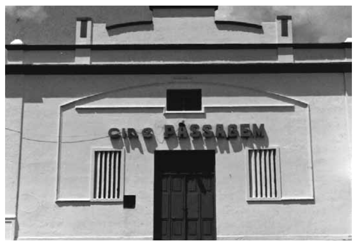
Figure 4. Cinema in Neópolis (Sergipe).