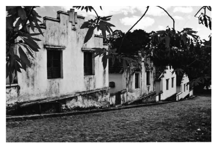
Figure 5. São Roberto factory in a workers' village in Gouveia (Minas Gerais).

In tall buildings, churches and factories, the staggered composition of geometric shapes was commonly used, consistent with an emphasis on height and with the search for a grandiose style. In these and other buildings for collective use — clubs, cinemas, etc. — the use of principles of hierarchy, expressed in staggered form and emphasis on the main entrance, is evident. In housing and small shops the déco aesthetic is found mainly in the form of ornamental details on the façades, which are used fairly sparingly and which appear mainly on the parapets.