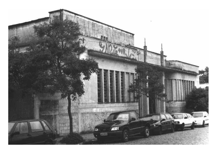
Figure 3. Club built by the São Pedro Spinning and Weaving Co., in Itu (São Paulo).

It can be seen that in Brazil déco style was expressed, above all, through geometric shape, staggered parapets and ornamentation, consistent with the trend known as Zig-Zag Modern. Rarer cases adopted rounded forms reflecting the Streamlined tendency.