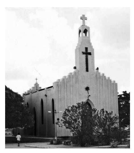
Figure 1. Church in Neópolis (Sergipe).