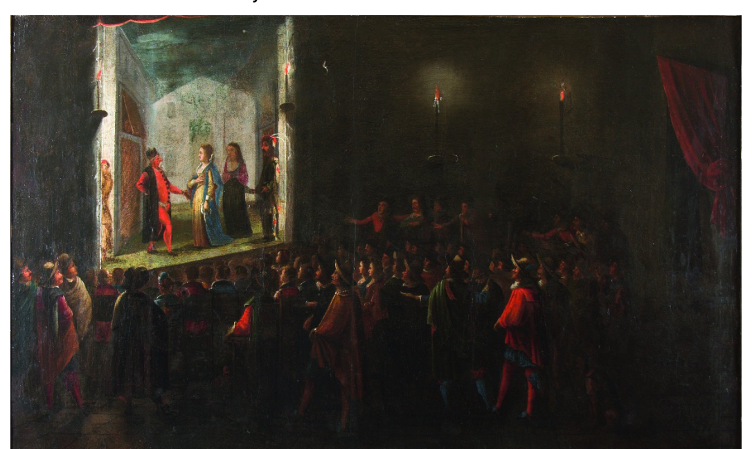
Figure 3 - Pátio de Comédias - 17th century. Oil on Canvas. Museu da Cidade de Lisboa.

Another important fact is that the 16<sup>th</sup>- and 17<sup>th</sup>-century Iberian theatres had open audience spaces like a courtyard; only the cazuelas had a coverture. The Patio das Arcas of Lisbon followed this typology until 1697, when a disastrous fire destroyed the building (BNP, 1699, Mç22). After its subsequent reconstruction, it did already count on a full coverture (BNP, 1690, Cod. 510). Considering the climate of Rio de Janeiro and assuming that the building that was visited by the French traveller was the same one that had been constructed in 1719, it is hard to imagine a fully open-air theatre active in the month of December, mainly because Rio has extremely showery summers, seriously affecting any economic activity which depends on good weather. The Frenchman also complained about the price of the tickets, which he considered very expensive for most locals, suggesting that the theatre would have been visited by a certain social elite of the city (SONNERAT, 1806, pp. 26–27). Soon after the French sailor had attended the performances, one of the prominent figures in Rio de Janeiro's theatrical scene emerged—Boaventura Dias Lopes, who later became a priest and passed into the Brazilian history as Padre Ventura.