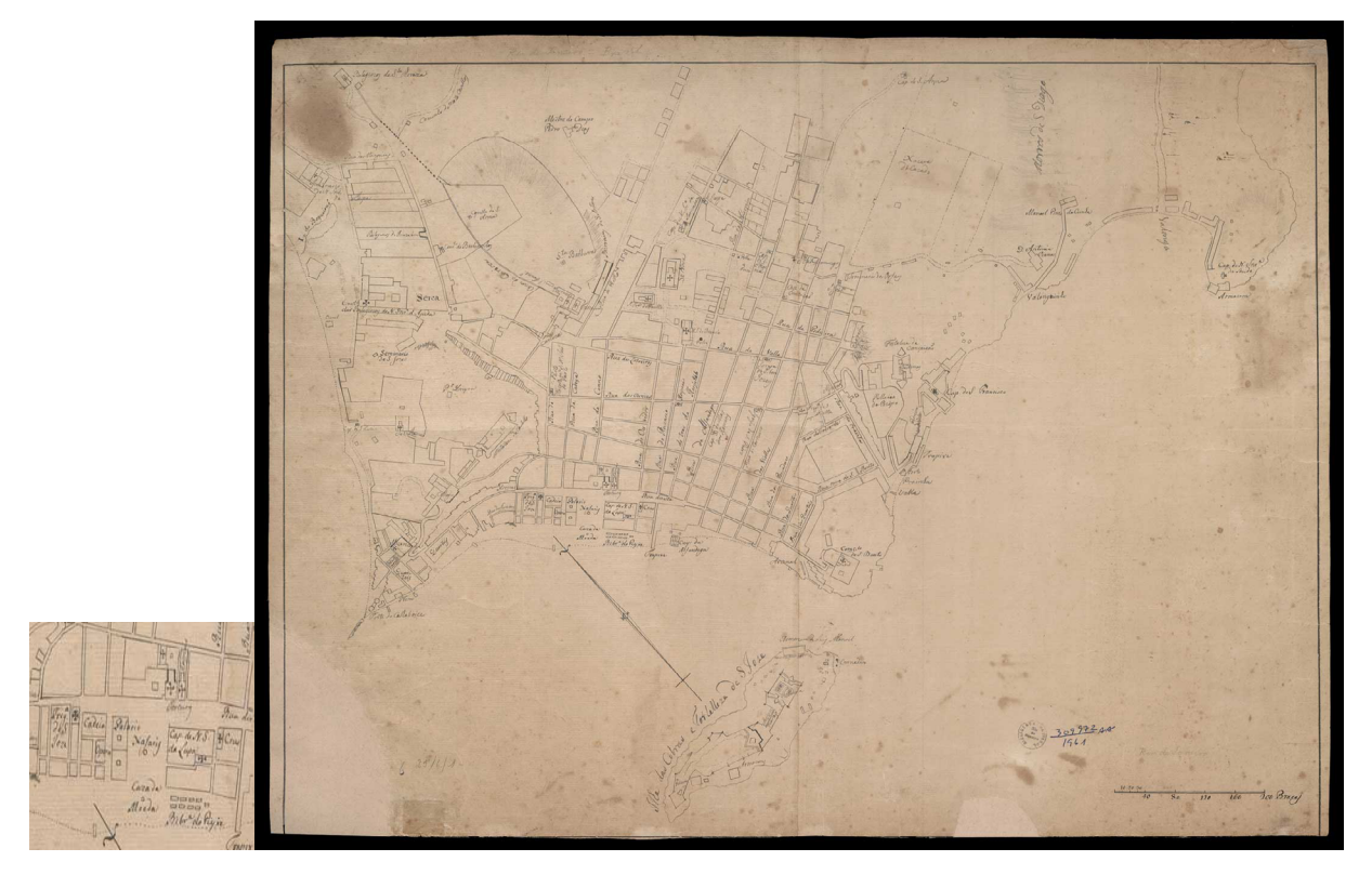
Fig. 4 - Map of the city of São Sebastião do Rio de Janeiro, (c1758–1760). RIO DE JANEIRO: National Library, Cartography Section, ARC.025,06,001.)

In fact, there are no references to Ópera dos Vivos after 1760. Historian Lino de Almeida Cardoso (2006, p. 77) quotes a document which mentions that, during the time of Marquis of Lavradio as the vice-king of Brazil, Ópera dos Vivos was consumed by a terrible fire; however, its reconstruction was guaranteed by Marquis a few months later. Marquis of Lavradio, Luís de Almeida Portugal e Mascarenhas, was the vice-king of Brazil between November 1769 and April 1778. Musicologist Rogério Budasz (2008, p. 35) writes that, in 1776, the building was devastated by a fire during a performance of Os Encantos de Medeia by António José da Silva. The author affirms that this incident became part of the collective memory of Rio de Janeiro, and the story was told repeatedly by chroniclers and historians. The fact is that no other documents confirm the activities of Ópera dos Vivos after the fire, which happened between 1769 and 1778. However, as we mentioned before, Ópera Nova was in full operation since 1758 or 1760, and, apparently, it was the principal theatre in Rio