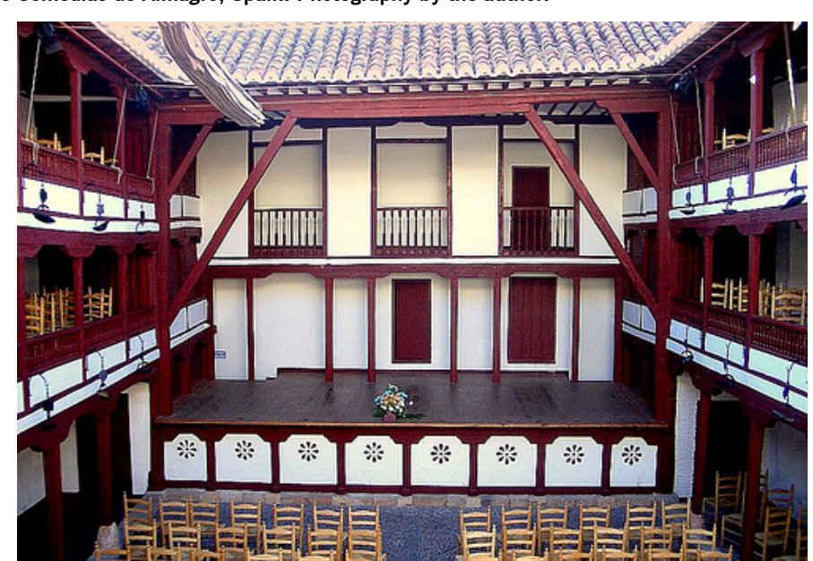
Fig. 2 - Corral de Comédias de Almagro, Spain.

century. The first permanent theatres in Portugal were built in the late 16<sup>th</sup> century (ANTT, HSJ, liv.940, 1595, fl.377v-380), the notable and oldest example of which was Pátio das Arcas , erected by the Spaniard Fernando Díaz de la Torre in 1582 (DE LOS REYES PEÑA, BOLAÑOS DONOSO, 2007, p. 265-315). In Spain, this theatre was an extension in every sense of the word. Not only did the repertoire and the actors come from Castile but the architectonical typology was also significantly close to that adopted in the Spanish Corrales de Comedias . According to some documents, still preserved in the National Archive of Torre do Tombo in Lisbon, the theatre had a quadrilateral shape with three orders of boxes besides the ground floor (ANTT, HSJ, liv.1186, ff.161-163). The boxes, known as cazuelas in Spain, were allocated to women and were closed by curtains. Ordinary men occupied the parterre (a.k.a. Patio de los Mosqueteros ), while the clergy and other figures occupied the boxes in the front of the stage. The description of the elements associated with the architecture of the theatre in Rio de Janeiro closely resembles the architectural features of the Iberian theatres of the 16<sup>th</sup> and 17<sup>th</sup> centuries with a few interesting exceptions.