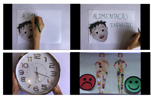
Alime: feed...; Alimentação infantil: infant feeding. Source: Research data.

In this stage, the technology was validated by nurse-judges, two with a doctoral degree in nursing and three with a master's degree in nursing. All the judges work in the area of technologies in health care and nursing, are members of the Processo de cuidar em saúde da criança e do adolescente (Care process in child and adolescent health) research group of the Universidade da Integração Internacional da Lusofonia Afro-Brasileira (UNILAB), and have experience in the topics of technologies in care in health and nursing, child and adolescent health, and health education.