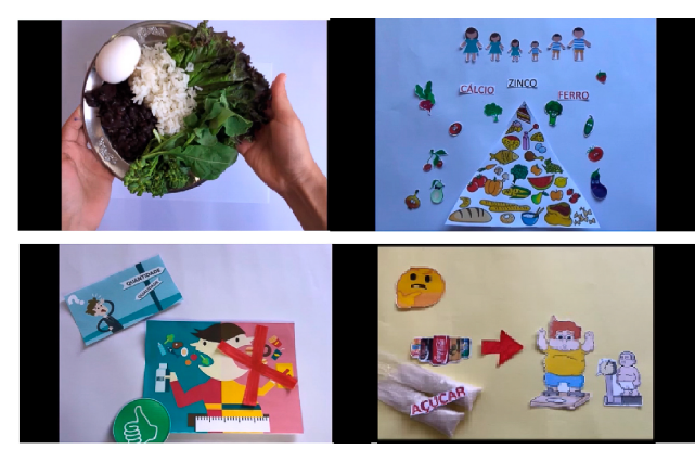
cálcio: calcium; zinco: zinc; ferro: iron; açúcar: sugar; quantidade: the amount; qualidade: quality.